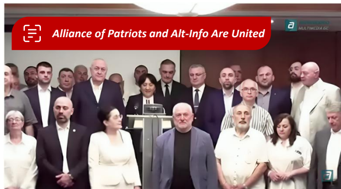
პატრიოტთა ალიანსი და ალტ-ინფო გაერთიანდნენ

The parties coming under the umbrella of the Union of Patriots of Georgia will participate in the elections of 26 October 2024 within the list of Alliance of Patriots of Georgia. The name of our party – Alliance of Patriots of Georgia and election number 8 will be presented on the election ballot. ❤️